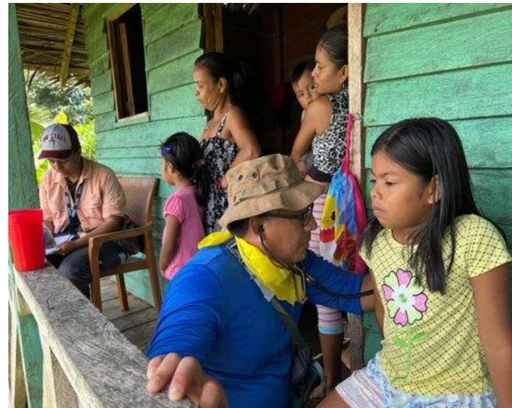
Project: Emerging Infectious Diseases Among Displaced Indigenous Communities in Coclecito, Panama 2022-2023