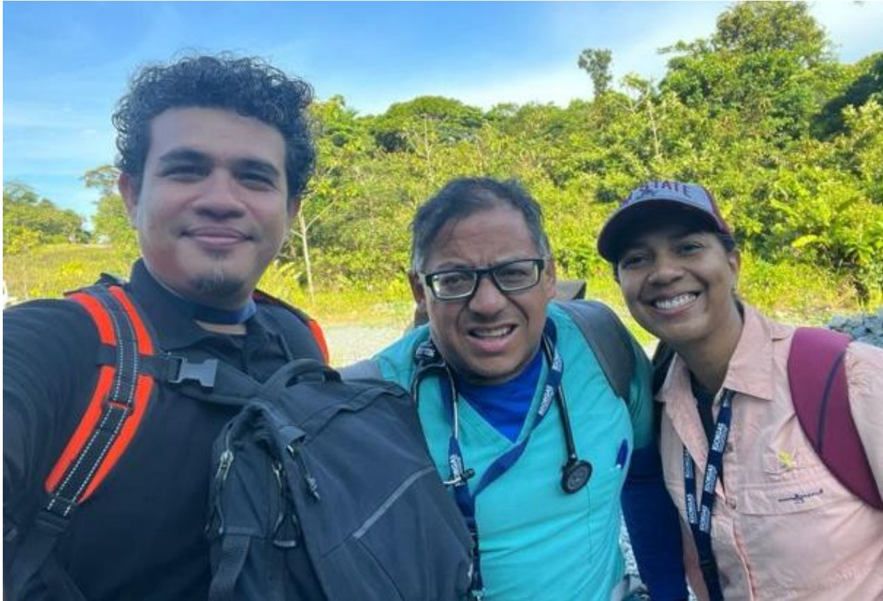
Colleagues at the Instituto Gorgas de Estudios de la Salud, Panamá