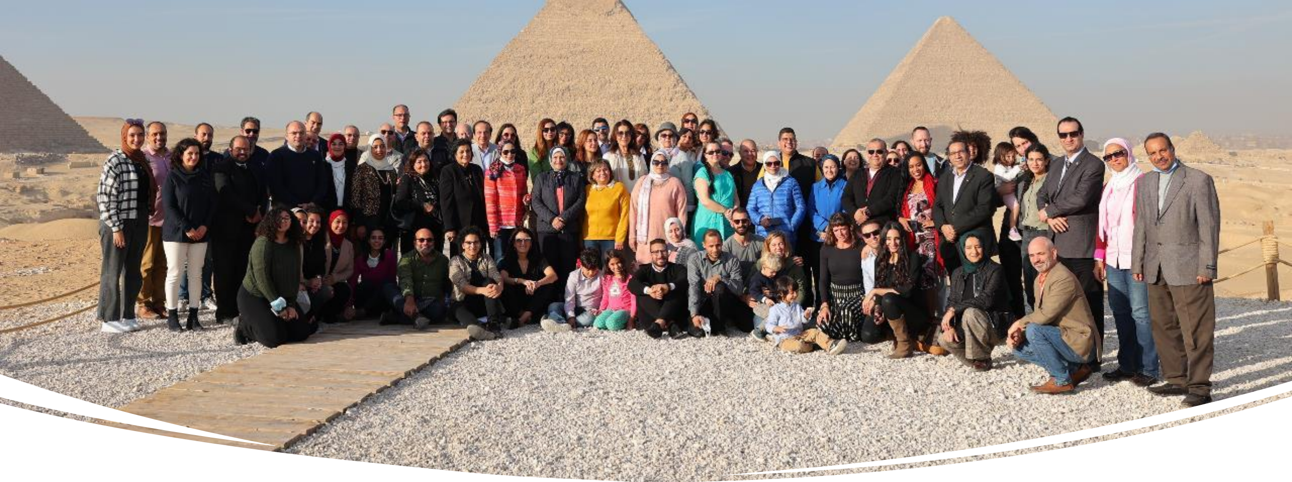
Fulbright grantees and alumni at the Commission's Christmas Party at the Pyramids