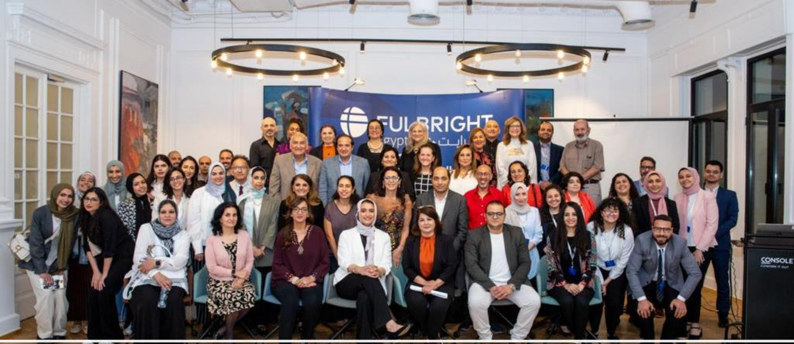
Networking event organized for Fulbright Grantees