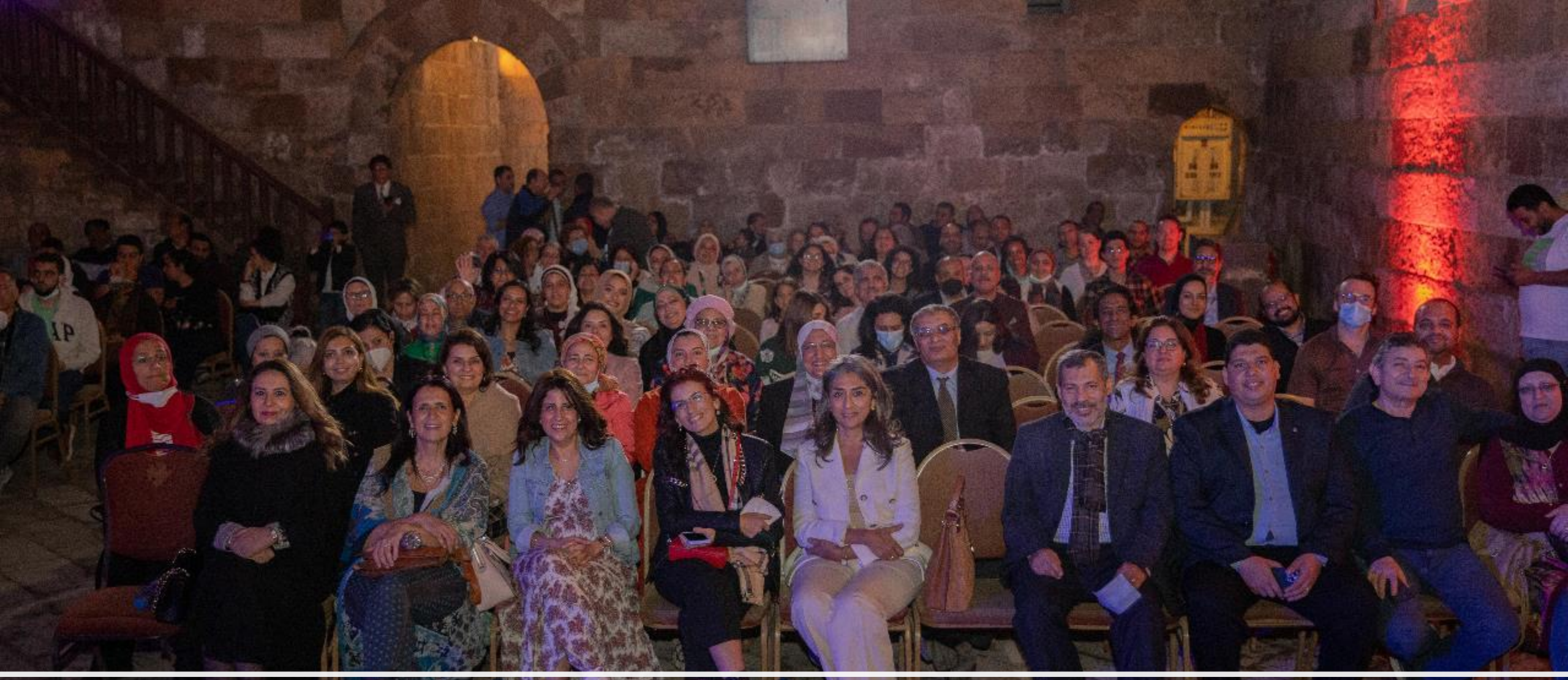
Fulbright alumni and grantees at the Ramadan Iftar and Tanoura Show