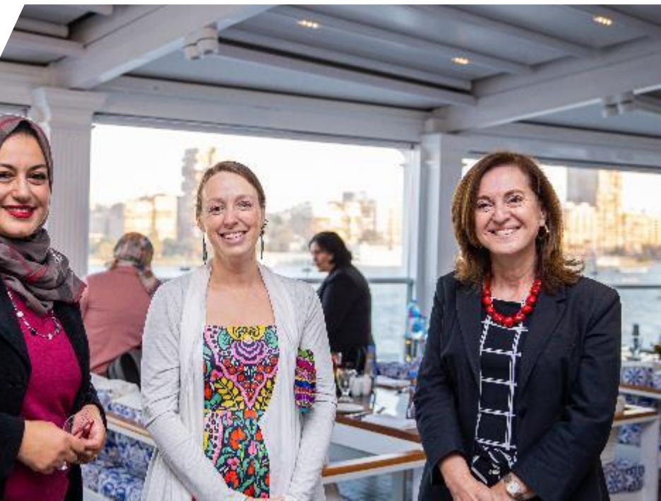
Commission's Thanksgivings Dinner