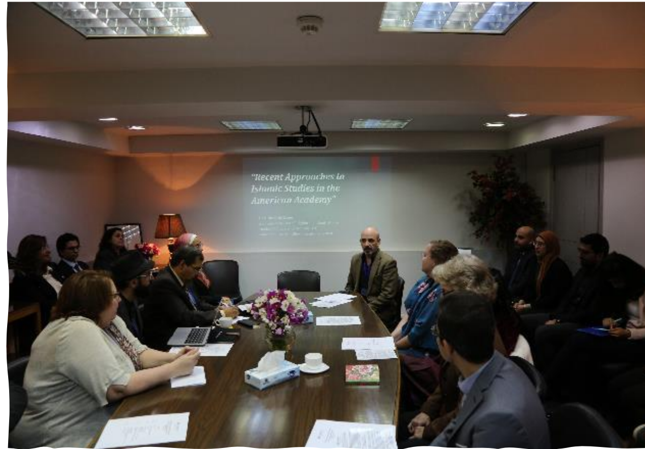
Networking event organized for Fulbright Scholar