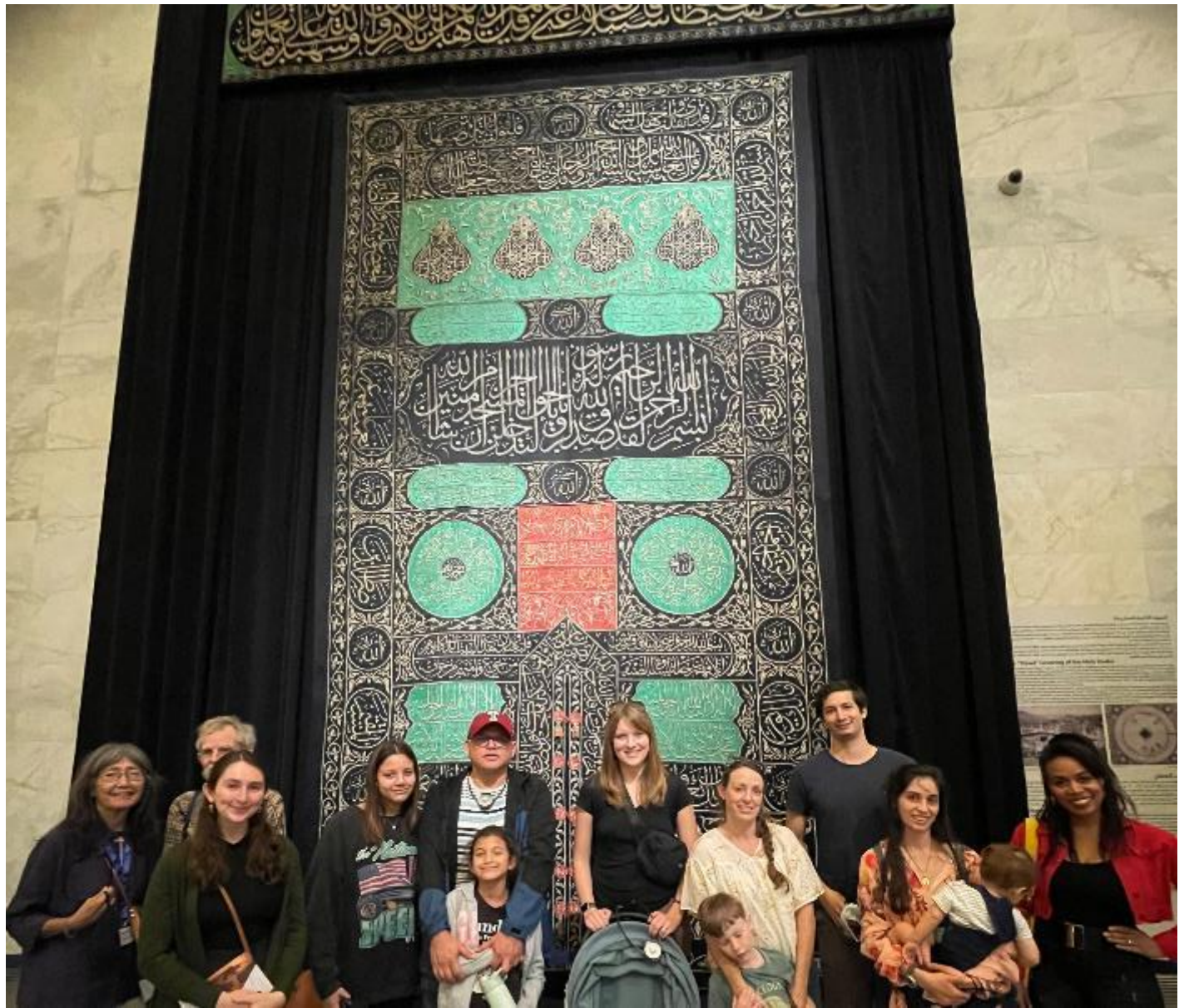
Visit to National Museum of Egyptian Civilization