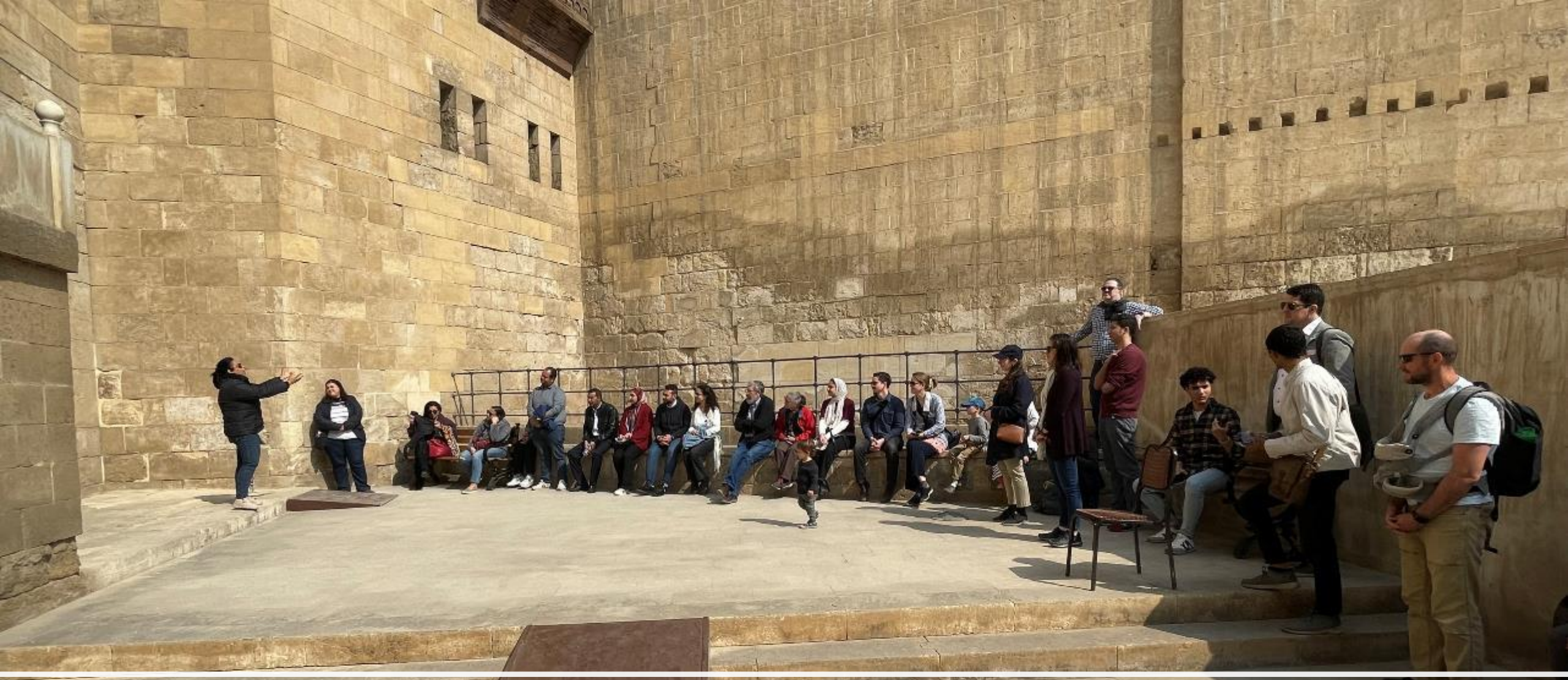
Tour of Al-Darb Al-Ahmar