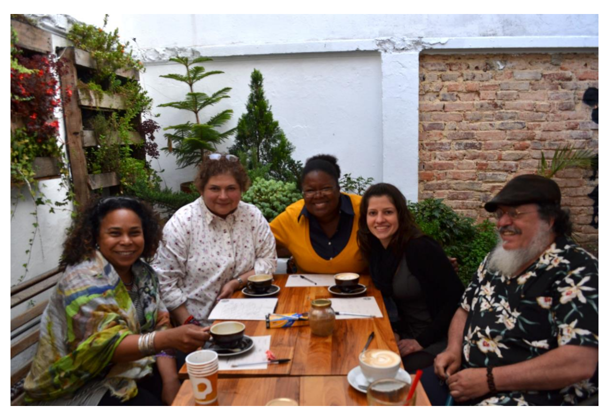
Fulbright U.S. Scholars to Colombia